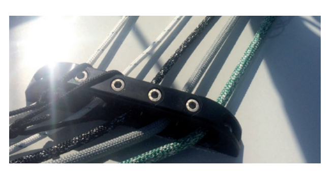
LO 18-26 as a triple version mounted on deck

Our KOHLHOFF LOOP® Organizer is available in two different sizes and any length you like!